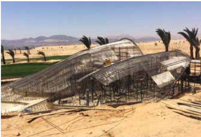
Framing the Ayla Golf Comfort Stations

innovative design for the Ayla Golf Resort Comfort Stations, or on-course rest areas, is intended to achieve consistency with the firm’s concept and technique for the Ayla Golf Academy & Clubhouse design. Both projects are part of an