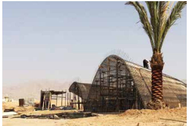
Completed Ayla Golf Comfort Station structural framework Photo credit: Oppenheim Architecture