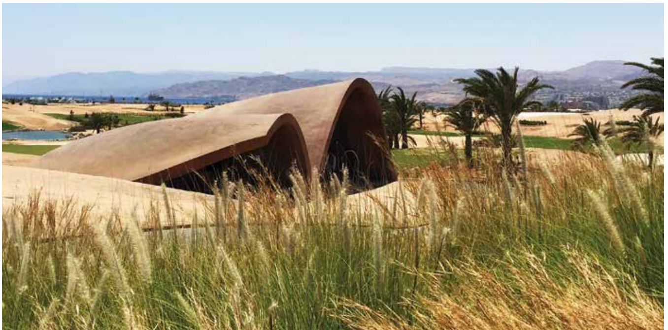
Completed Ayla Golf Comfort Station