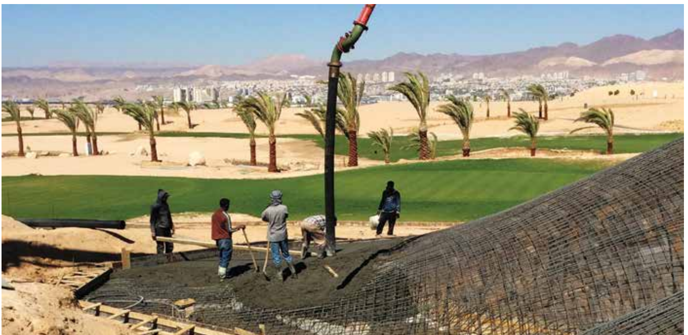
Ayla Golf Comfort Station shotcrete application Photo credit: Oppenheim Architecture