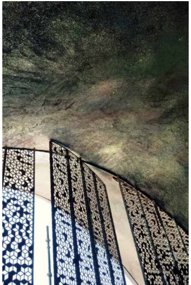
Completed Ayla Golf Comfort Station interior detail

The overall development will eventually encompass residential, hotel, and commercial space, all centered around an 18-hole, Greg Norman-designed, USPG tournament-rated