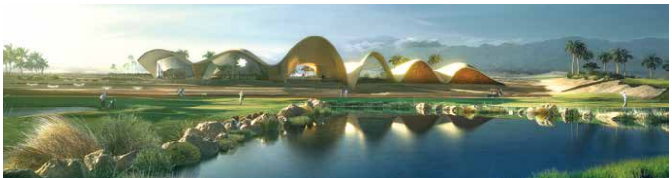
Ayla Golf Academy & Clubhouse (Rendering credit: Luxigon)